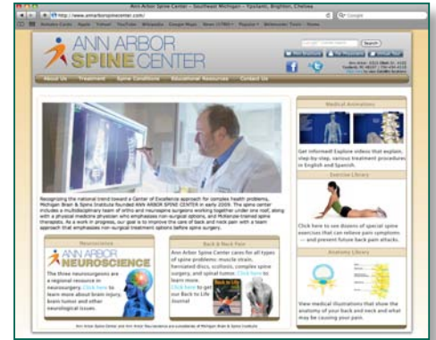
The group is investing in patient education, including an online spine encyclopedia at AnnArborSpineCenter.com, with an exercise and anatomy library, and medical animations that explain symptoms and treatment options.